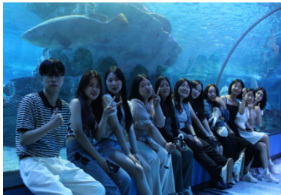
At an Aquarium