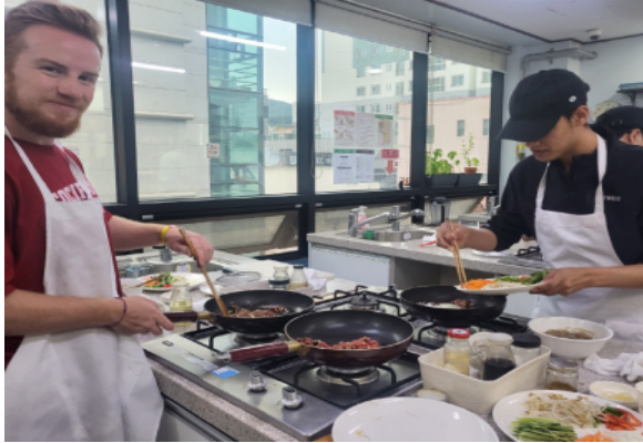
Korean Cooking Class