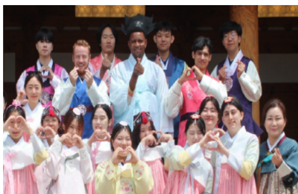
Trying on a Hanbok