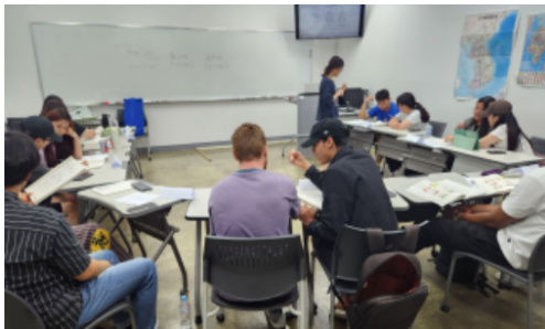
Korean Language Course