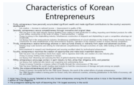
Korean Economy Course Material