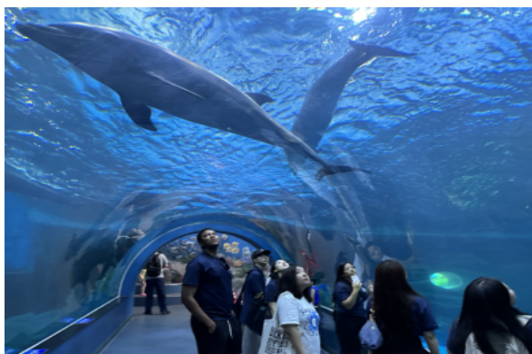
At a Whale Museum