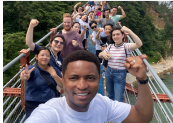
At a Swinging Bridge