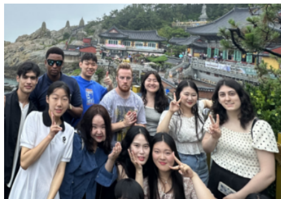
At a Yonggungsa Temple