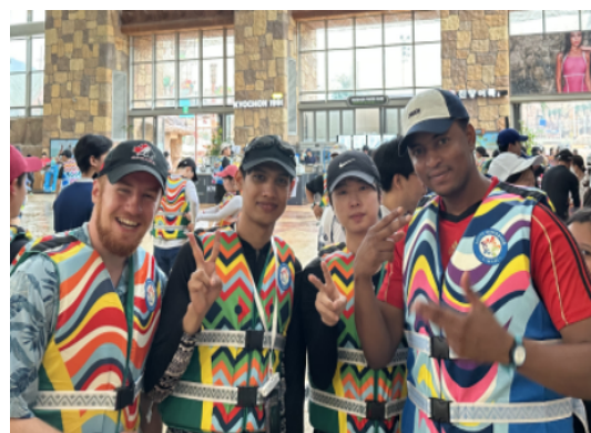
At a Water Amusement Park