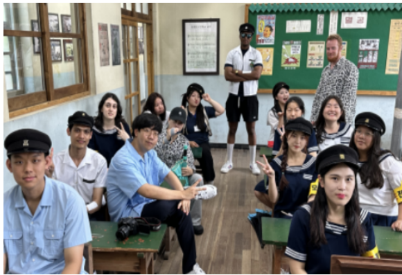
Back to the 1970s